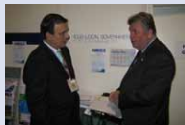
Marcelo Ebrard, Mayor of Mexico City and Greg Nickels, former Mayor of Seattle at Local Governments Climate Lounge

The Summit, hosted by Marcelo Ebrard, Mayor of Mexico City and Chair of the World Mayors Council on Climate Change, will offer local governments the opportunity to engage in the Global Cities Climate Covenant (the Mexico City Pact). By signing this Pact, local governments agree to voluntary commitments to mitigating greenhouse gas (GHG) emissions and to adapt their cities to the impacts of climate change. At the same time they agree to register their commitments in a transparent way and to periodically report their progress with the carbonn Cities Climate Registry. For further information: www.wmsc2010.org