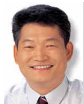
Young-gil Song Mayor, Incheon Metropolitan City

We convene in Korea's third largest metropolis to discuss the Future of Cities. Meeting in a central place in Eastern Asia allows us to look at urban development in large, fast growing and even new cities in a region experiencing rapid urbanization.